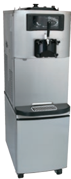
Optional Cart with front opening door