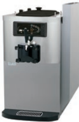
Optional Top Air Discharge Chute