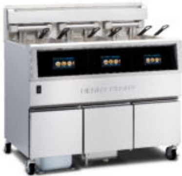
OFE 513 3-well open fryer