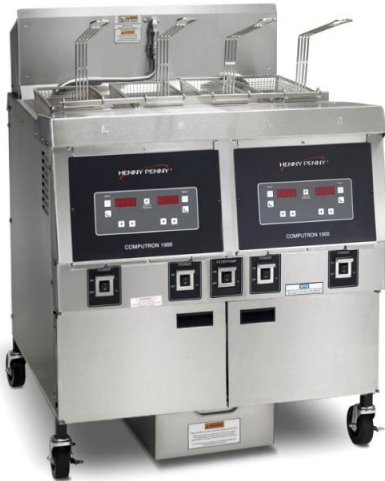
OFE 322 2-well electric open fryer with split vats and Computron™ 1000 control

OFE 321 1-well electric OFE 322 2-well electric OFE 323 3-well electric