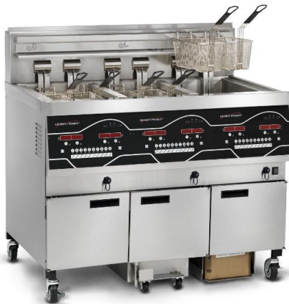
EEE 143 3-well open fryer