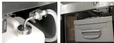
Oil replenished automatically from JIB for multi-well (left) or reservoir for 1-well (right)

Henny Penny Evolution Elite® open fryers use innovative filtering and oil level technology to extend oil life, improve product quality and reduce overall oil consumption and costs. Here's how: